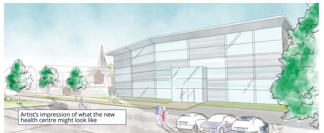
Artist's impression of what the new health centre might look like

The new library space on the present site will be designed to be flexible, enabling different types of activities and events to take place. It will include exhibition and performance space, alongside confidential rooms that can be used for workshops, classes or for groups to meet. There will be space throughout the building where