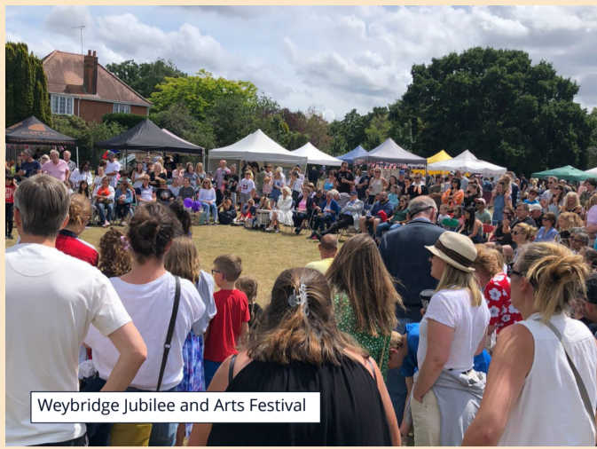
Weybridge Jubilee and Arts Festival

It has been pointed out in a letter of representation that the impact on local roads of the estimated 99 HGVs per day, as well as numerous delivery vans and commuter transport (of up to 450 employees), would be significant and would almost certainly affect traffic in Weybridge High Street, Heath Road and Portmore Park Road. Indeed, National Highways has asked for a 56 day delay in any decision so that a further review of the methods used to calculate the trip generation